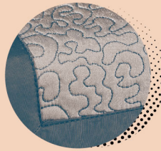
Darning / embroidery